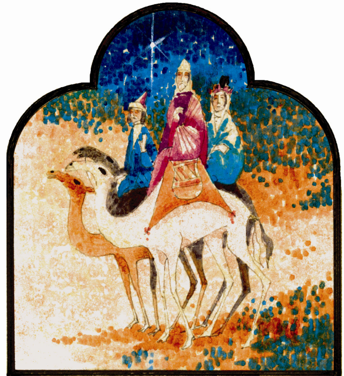
© J. S. Paluch Co., Inc.

Parish Office 642-5562 School Office 642-2839 stpeteroffice@att.net ECLC 642-9359 Fax Line 642-2839